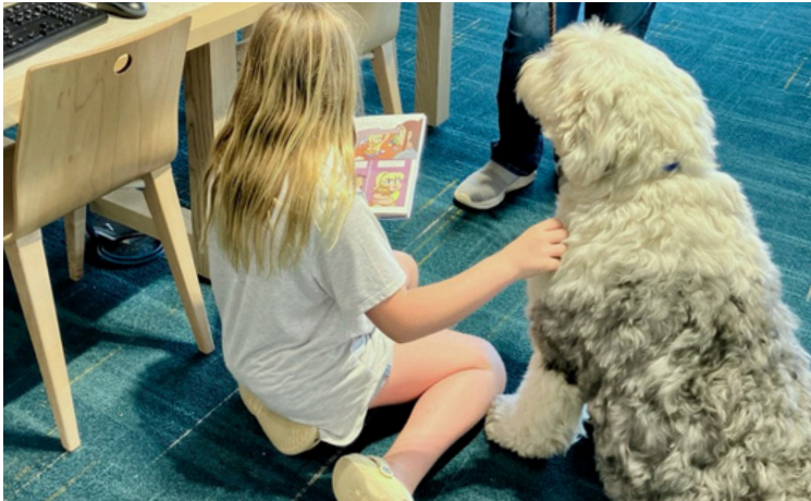
Therapy dogs visited the library!