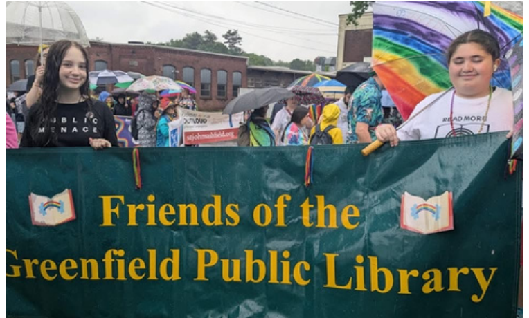
So thankful to these two library patrons for carrying the banner the entire parade and in a downpour!